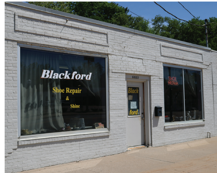
Blackford Shoe Repair at 6833 Douglas Ave., Urbandale.

"All the stuff I got here," he said, gesturing to