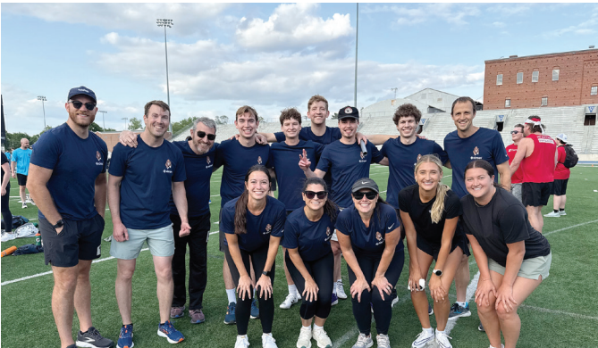
Zirous staff participate in a variety of events at the Corporate Games.