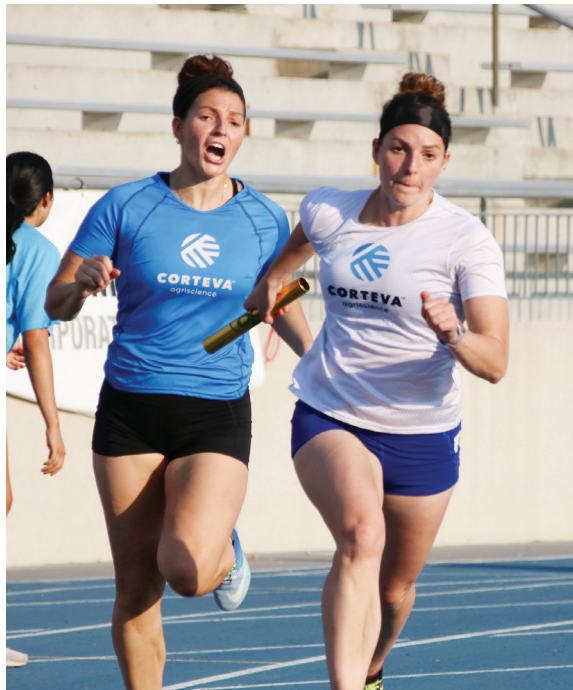
The Corteva Agriscience 4x100 team races.