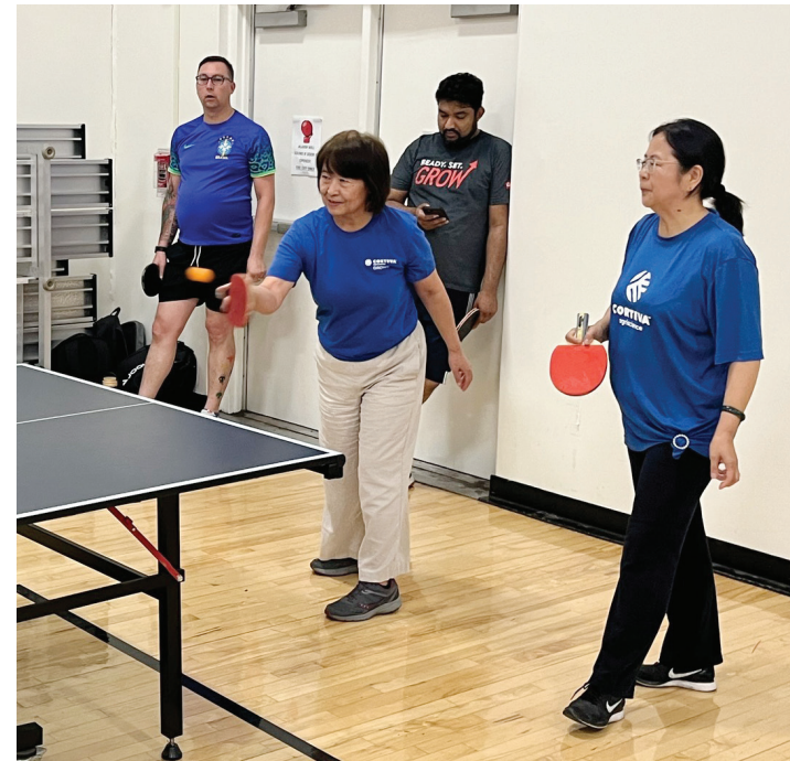
Corteva Agriscience employees in action.

In 2021, Corteva launched an internal version of the games called the Heart of Nature Games