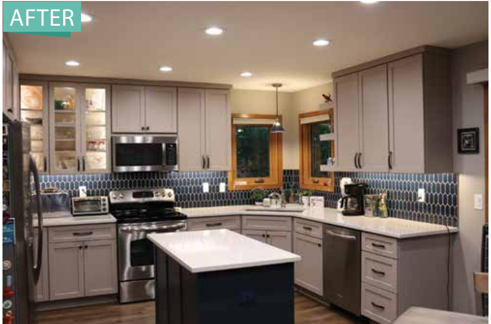
Mike and Linda Schroeder gutted their kitchen to remove the honey-oak cabinets, laminate flooring, formica countertops and fluorescent box light and create a modern and colorful kitchen which included the cabinets with glass doors and backlighting Linda wanted.