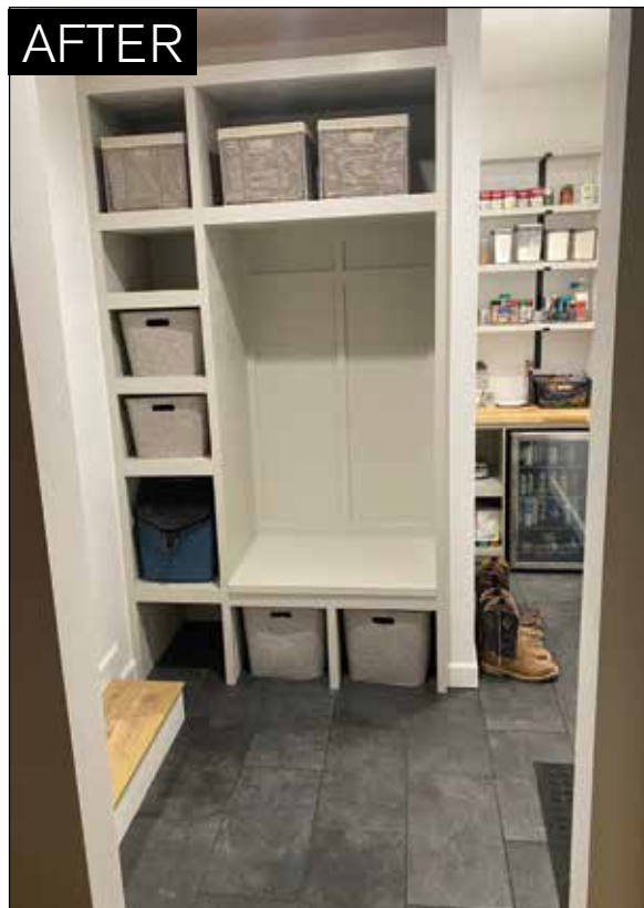
The Reeses added storage in the renovated mudroom space.