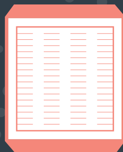
TRADITIONAL OUTDOOR UNIT (CUBE STYLE)